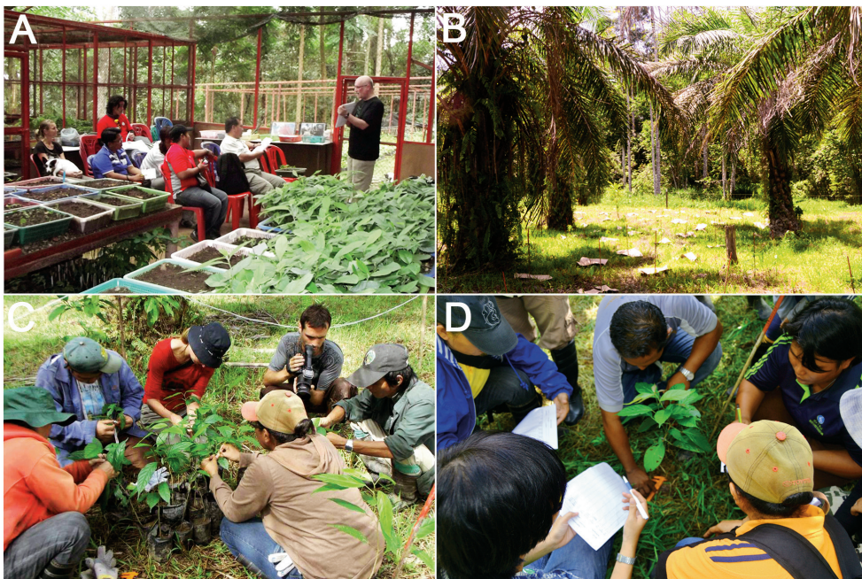
Figure 3. Activities to restore habitat of the Bornean elephant. A: Forest restoration workshop at the research nursery of FORRU (Chiang Mai University) with a focus on nursery maintenance, research and reforestation techniques to improve the current reforestation programs of HUTAN and MESCOT. B: The beginning of the transformation of a palm oil plantation back into a forest ecosystem. The planted seedlings have been covered by cardboard mulch mats in order to suppress the weed growth and reduce the labor cost of weeding. Also, they help to preserve the moisture into the soil and will turn into compost when rotten down. C: Numbering and labeling the seedlings before planting them out in the experimental plots by members of HUTAN, the Lower Kinabatangan Wildlife Sanctuary, Sabah. D: Members of HUTAN are using a vernier caliper to measure the root collar diameter of the planted trees of the experimental plots during a tree monitoring workshop near Sukau, Sabah.

adopted, testing 15 indigenous forest tree species (20 individuals per species per plot) for field performance, both in an oil palm plantation and along an old logging road. The plots are monitored (tree height, crown width, root collar diameter, health and weed scores) for both relative species performance and the effects of various fertilizer treatments, two weeks after planting and subsequently, at the end of the first and second flood seasons. The first report will be published in March 2015 and will provide a guide as to the most suitable tree species for swampy areas, in oil palm plantations and other degraded areas. This collaborative project lays the foundation for a sustainable program that grows, plants and cares for a minimum of 25,000 trees annually, hopefully playing a major role in the conservation of both the Bornean elephant as well as the multitude of other species with which it shares its habitat.