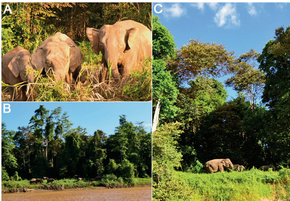
Figure 1. The Bornean elephant ( Elephas maximus borneensis ) in the Lower Kinabatangan Wildlife Sanctuary, Sabah, Borneo. A: Elephants at the riverbank near Sukau, on the way to the old palm oil plantation field site, lot 2, January 2013. B: About 20 elephants gather at the riverbank before crossing the Kinabatangan River, lot 6, May 2013. C: Elephants near the Danau Girang Field Centre, where researchers track their movement using GPS-collars, lot 6, May 2013.

In the Lower Kinabatangan Wildlife Sanctuary (Fig. 2), Bring the Elephant Home Foundation cooperates with HUTAN (Kinabatangan Orang-utan Conservation Programme), KOPEL Community Cooperative (MESCOT), Danau Girang Field Centre (DGFC) and the Sabah Wildlife Department to restore elephant habitat. Recently, the Forest Restoration Research Unit (FORRU) of Chiang Mai University joined the collaboration, by providing a